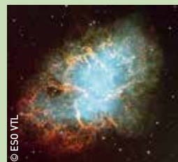
The crab nebula at 6000 light-year