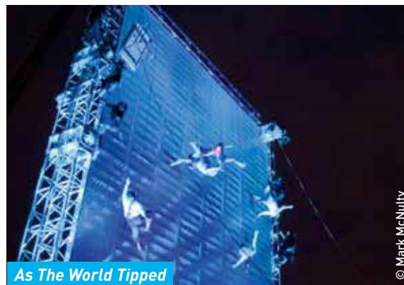
As The World Tipped