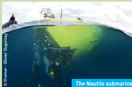
The Nautilus submarine

The program of the three domes is completed by demonstrations of robots, submarines, radio-controlled models in the central pool, and an underwater galleon (The Nautiluscope) to make children and families discover sciences.